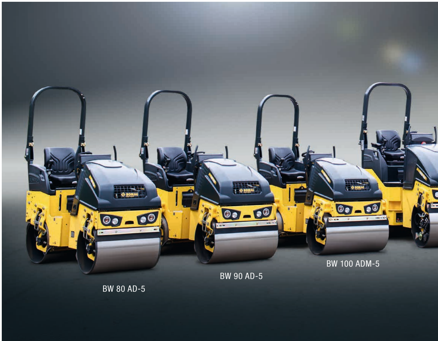
BW 80 AD-5