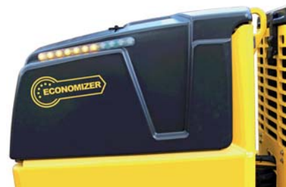
Higher quality, lower costs ECONOMIZER - The compaction display (optional)