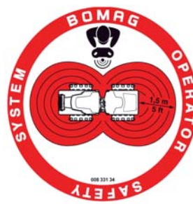
Safe operation Radio/cable remote control with integrated operator protection