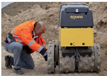
Flexible working widths Original BOMAG drum extensions